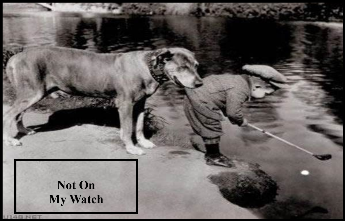
Not On My Watch